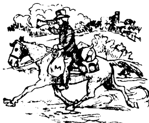
THE OLD TIME MAIL CARRIER